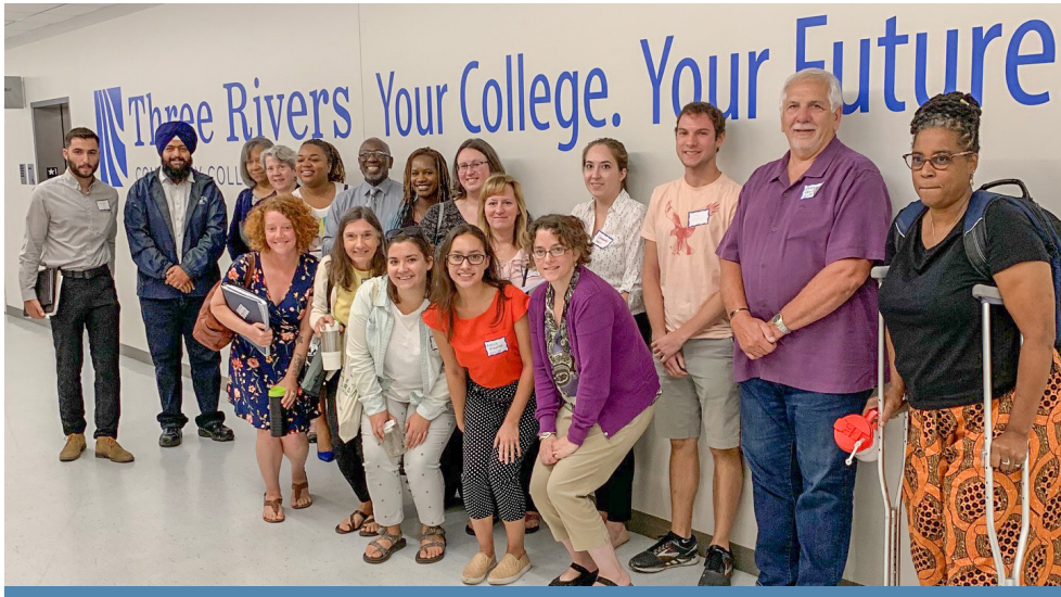
Individuals from 13 towns participate in Sustainable CT training at Three Rivers Community College.