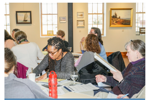
Right: Nonprofit board and staff representatives at the 2019 Diversity, Equity and Inclusion workshop.