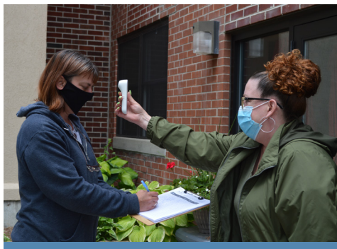
Staff from The Arc Eastern Connecticut using their newly acquired PPE supplies, purchased through a grant from the Neighbors for Neighbors Fund.

To see a complete list of the Neighbors for Neighbors grants, visit cfect.org/NFNFundGrants . On the Spotlight page, you can read more about some of our incredible nonprofit partners who have been addressing food insecurity, housing, healthcare, shelter, childcare and other supports to ensure the stability and well-being of our region's residents.