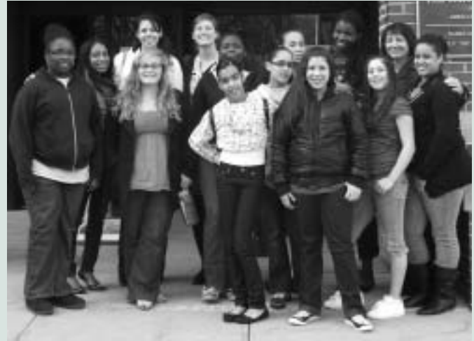
These aren't just students; they are future business owners, Chamber of Commerce presidents, political leaders, nonprofit directors, artists, and parents. They learn about the responsibilities of community here.

“I think the most important thing to know about the Community Foundation is that it understands that we’re all connected and that what impacts one, impacts us all. It’s the money, yes, but it’s ensuring that the money has a more lasting effect.”