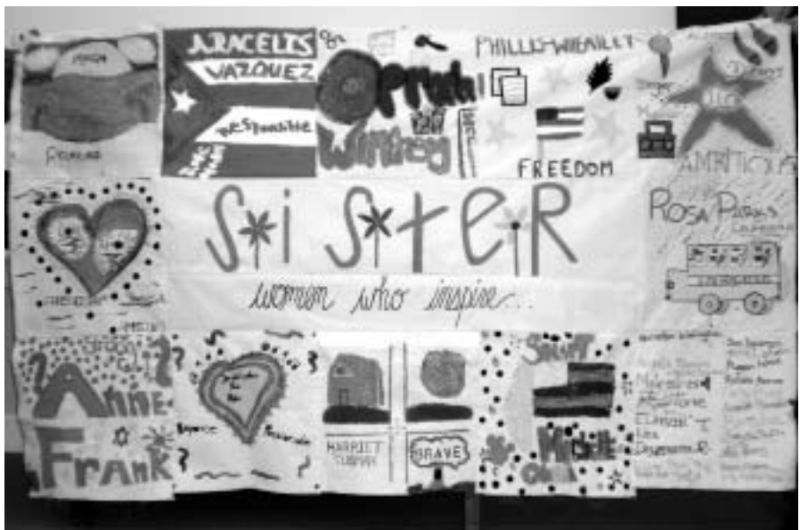
A quilt created by New London middle school girls and Connecticut College students to powerfully reflect the women who inspired them as part of the SISTER program run by the college's Office of Volunteers and Community Service.