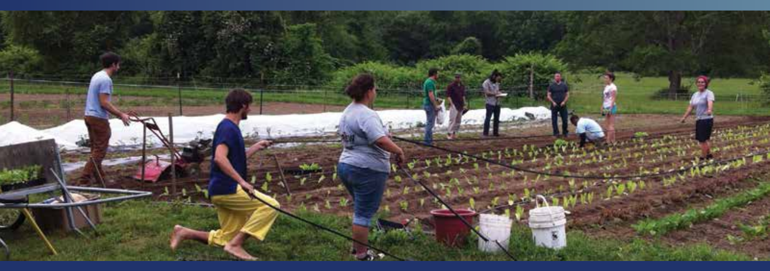
At the FRESH Farm (generously hosted by Waterford Country School), a dynamic group of volunteers, youth and staff work together to learn the skills they need to feed themselves while forging friendships and support FRESH's vision of healthy food for everyone

Donor Advised funds allow the donor, or persons designated by the donor, the opportunity to make periodic recommendations to the Community Foundation for grants to be made from the fund.