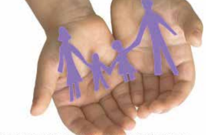
Partners In Independence: An Adult Mentoring Program