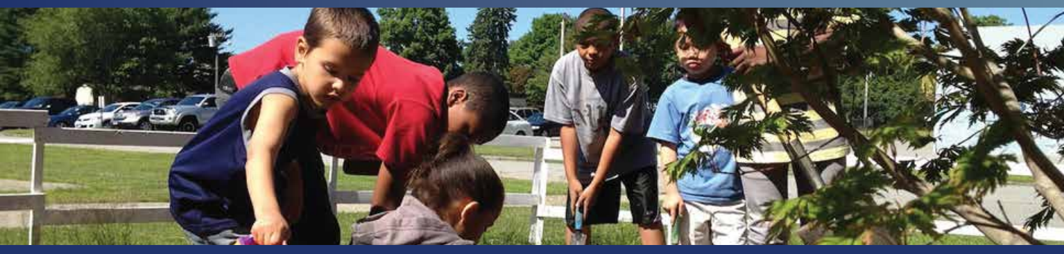
Children taking part in the Norwich Bridges Summer program.

Unrestricted funds help to address emerging community needs. Donors place their trust in a group of knowledgeable volunteers and staff to review grant applications, conduct site visits and then use these discretionary dollars to make grants to organizations that make a positive and meaningful difference.