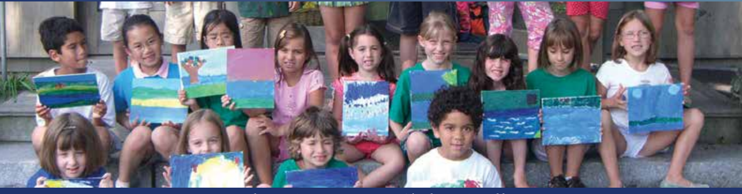
Hartman Education Center summer campers, The Florence Griswold Museum

Caring people and organizations throughout eastern Connecticut gave generously in 2013 to support issues they care about - thank you!