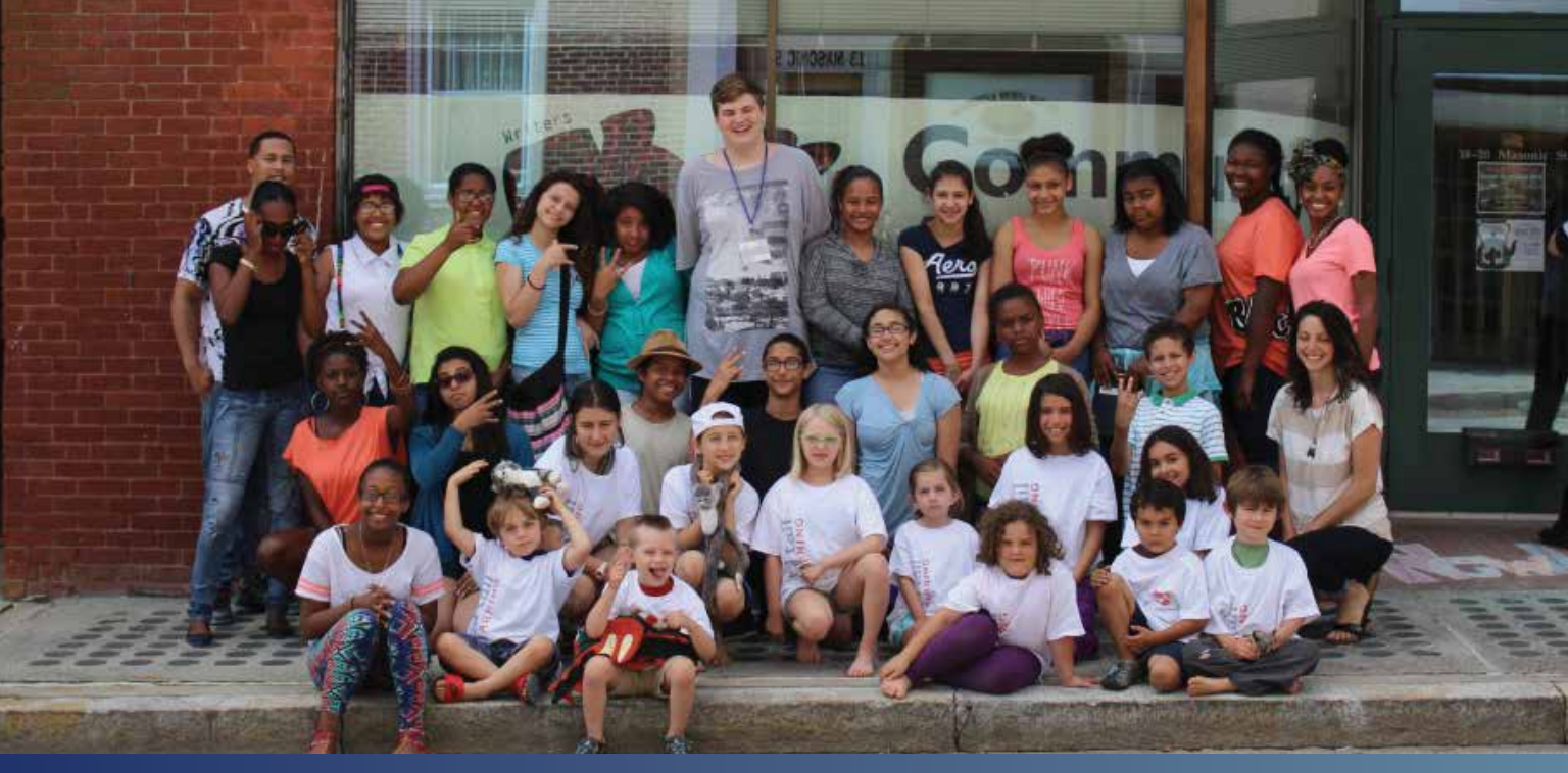
For more than a decade Writer's Block, Inc. has encouraged New London County youth (ages 10-21) to use writing, music, and performance as tools to address personal and social challenges and to bring alive their ideas and creativity in theatrical performances.

Mystic Area Shelter & Hospitality (MASH) Mystic Arts Center Mystic Ballet Mystic Seaport Museum Natchaug Hospital, Inc. Nature Conservancy in Connecticut Neighborhood Music School New England Science & Sailing Foundation New London Adult & Continuing Education New London Community Boating New London Community Meal Center New London Community Orchestra New London Homeless Hospitality Center New London Maritime Society